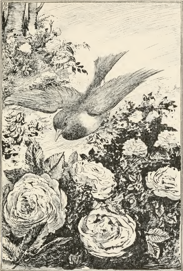
A HEAVENLY RUSH OF WINGS